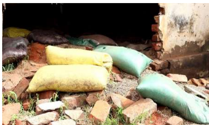
Figure 2. Bags of maize destroyed by floods in Chikwawa District

The floods affected all the Extension Planning Areas (EPA) in Chikwawa. 4 Similarly, all EPAs in Nsanje district were affected by the flood. 5,6 District floods reports indicate that a total of 42,276.7 hectares of various crops in Chikwawa district and 12,981 hectares in Nsanje district were affected by the flood. The floods came when most of the crops were in vegetative stages, and most farmers had already applied fertilizers. The crops were silted, washed away, submerged, or lodged by the flood.