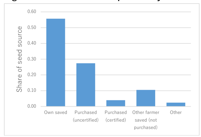
Figure 1: Sources of seed planted by farmers

suggesting some recognition of the need to use improved varieties.